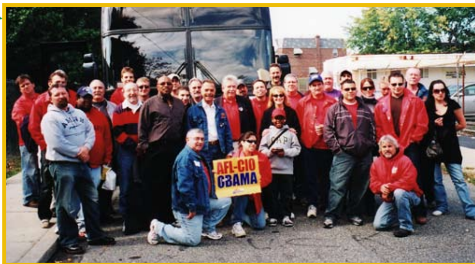
Local 1103 political activists bused to battleground state Pennsylvania to turn out the Labor vote for Barack Obama

What started out nearly two years ago when the Republican and Democratic candidates started jockeying for our votes in the nation's primaries and caucuses finally culminated last month – and the results were worth the efforts that many CWA men and women did across the country.